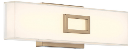
Shown in antique brushed brass / white

The Restore LED Vanity Light by Access Lighting starts with a square steel wall plate that resembles a buckle, providing support at the center of the square opal glass tube. The milky glass works to transform the light of the internal LEDs into plentiful ambience for bathroom tasks. This vanity light can be installed vertically or horizontally. Suitable for commercial or residential use.