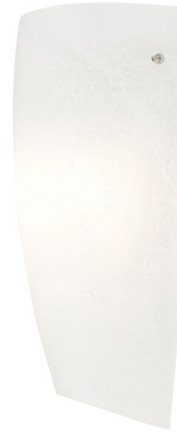
Shown in brushed steel / alabaster

The Daphne LED Wall Sconce adds a clean decorative look to your interior space. The smooth glass diffuser is complemented with steel knobs that seem to hold the glass in the air. Suitable for commercial or residential use.