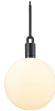
Shown in gun metal / opal

COLOR RENDERING . . . . . 80 CRI LAMP COLOR . . . . . 2700K LUMENS/WATT . . . . . 100.00 LUMINOUS FLUX . . . . . 500 lumens