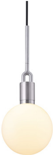
Shown in: Steel / Opal

The Forked Globe Pendant showcases a handblown Glass shade, available in Opal or Smoked. It features their signature diamond-cut linear knurling made of solid metal and refined by hand.Brass: Made from precision-machined solid brass and finished with two layers of durable satin lacquer. This finish will age slowly, moving from radiant brass to deeper and golden within a few years.Gun Metal: Made from Stainless Steel and then finished with Gun Metal PVD. Will stay the same for years to come. Easy to clean.Steel: Made from solid stainless steel and refined by hand. Steel is Buster + Punch's most durable finish and will remain the same for years to come.