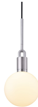
Shown in steel / opal

PRODUCT DIMENSIONS . . . . . Canopy: 4.9" diameter COLOR RENDERING . . . . . 80 CRI LAMP COLOR . . . . . 2700K LUMENS/WATT . . . . . 100.00 LUMINOUS FLUX . . . . . 500 lumens