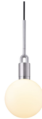
Shown in steel / opal

PRODUCT DIMENSIONS . . . . . Canopy: 4.9" diameter COLOR RENDERING . . . . . 80 CRI LAMP COLOR . . . . . 2700K LUMENS/WATT . . . . . 100.00 LUMINOUS FLUX . . . . . 500 lumens