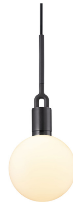
Shown in gun metal / opal

COLOR RENDERING . . . . . 80 CRI LAMP COLOR . . . . . 2700K LUMENS/WATT . . . . . 100.00 LUMINOUS FLUX . . . . . 500 lumens