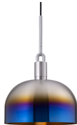
Shown in burnt steel

COLOR RENDERING . . . . . 80 CRI LAMP COLOR . . . . . 2700K LUMENS/WATT . . . . . 64.29 LUMINOUS FLUX . . . . . 450 lumens