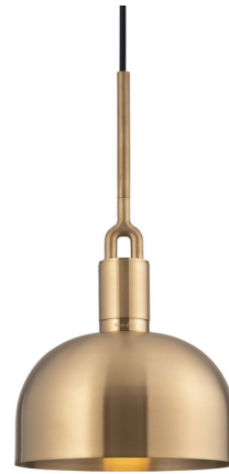
Shown in brass

PRODUCT DIMENSIONS . . . . . Canopy: 4.9" diameter COLOR RENDERING . . . . . 80 CRI LAMP COLOR . . . . . 2700K LUMENS/WATT . . . . . 64.29 LUMINOUS FLUX . . . . . 450 lumens