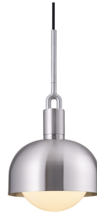
Shown in steel / opal

COLOR RENDERING . . . . . 80 CRI LAMP COLOR . . . . . 2700K LUMENS/WATT . . . . . 100.00 LUMINOUS FLUX . . . . . 500 lumens