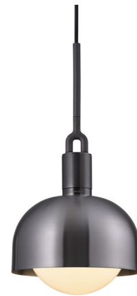
Shown in gun metal / opal

PRODUCT DIMENSIONS . . . . . Canopy: 4.9" diameter COLOR RENDERING . . . . . 80 CRI LAMP COLOR . . . . . 2700K LUMENS/WATT . . . . . 100.00 LUMINOUS FLUX . . . . . 500 lumens