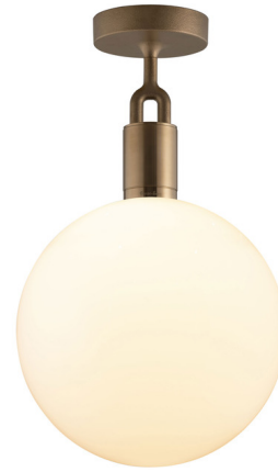
Shown in brass / opal

COLOR RENDERING . . . . . 80 CRI LAMP COLOR . . . . . 2700K LUMENS/WATT . . . . . 100.00 LUMINOUS FLUX . . . . . 500 lumens