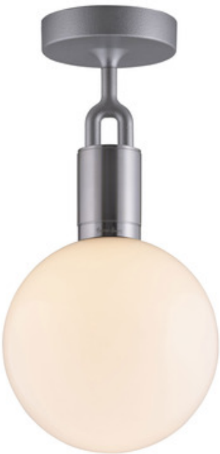
Shown in: Steel / Opal

The Forked Globe Ceiling Light showcases a suspended handblown Glass shade, available in Opal or Smoked. It features their signature diamond-cut linear knurling made of solid metal and refined by hand. Brass: Made from precision-machined solid brass and finished with two layers of durable satin lacquer. This finish will age slowly, moving from radiant brass to deeper and golden within a few years. Gun Metal: Made from Stainless Steel and then finished with Gun Metal PVD. Will stay the same for years to come. Easy to clean. Steel: Made from solid stainless steel and refined by hand. Steel is Buster + Punch's most durable finish and will remain the same for years to come.