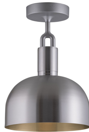
Shown in steel

COLOR RENDERING . . . . . 80 CRI LAMP COLOR . . . . . 2700K LUMENS/WATT . . . . . 64.29 LUMINOUS FLUX . . . . . 450 lumens