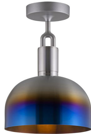
Shown in burnt steel

PRODUCT DIMENSIONS . . . . . Canopy: 4.7" diameter COLOR RENDERING . . . . . 80 CRI LAMP COLOR . . . . . 2700K LUMENS/WATT . . . . . 64.29 LUMINOUS FLUX . . . . . 450 lumens