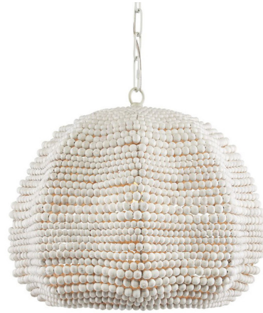
Shown in whitewash / white

The Octavia Pendant has a flowing profile made of wood beads that have been whitewashed and strung along metal wire so that the shape will remain whimsical. This white pendant fits perfectly within the coastal design aesthetic that is sought after for interiors. The desire for casual elements that hold up to the highest design standards is driving this movement.