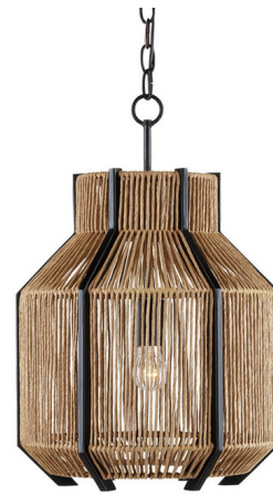
Shown in black / black / natural

The Mali Pendant, designed by Clarence Mallari, has a complex interplay of sleek and earthy elements. The lines that rise above and below the natural woven shade of the rope pendant are made of wrought iron in a satin black finish, as are the chain from which it is hung and the hardware that holds the bulb. These are the clean-lined elements that contrast the Kraft paper twine, which is tightly woven but not so dense that it interrupts the warm glow of illumination from its interior.