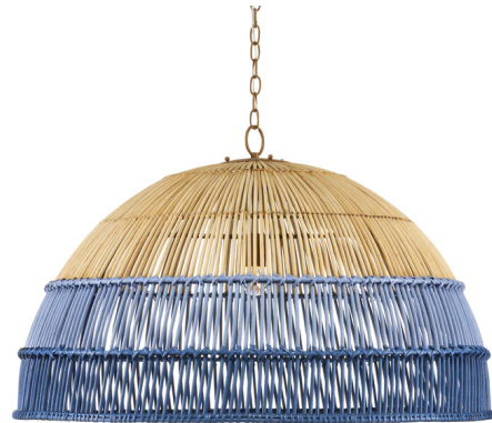
Shown in khaki / blue