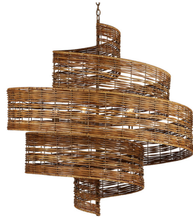
Shown in khaki / natural

COLOR . . . . . Natural BODY FINISH . . . . . Khaki WATTAGE . . . . . 300W DIMMER . . . . . Standard 120V DIMENSIONS . . . . . 45"W x 52"H BULB NOT INCLUDED . . . . . 5 x A19/Medium (E26)/60W/120V Incandescent OTHER BULB OPTIONS . . . . . 5 x A19/Medium (E26)/120V LED COUNTRY OF ORIGIN . . . . . Philippines