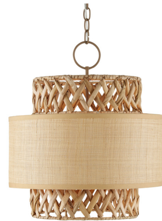
Shown in khaki / natural / tan

COLOR . . . . . Tan BODY FINISH . . . . . Khaki / Natural WATTAGE . . . . . 240W DIMMER . . . . . Standard 120V DIMENSIONS . . . . . 18.25"W x 20.25"H BULB NOT INCLUDED . . . . . 4 x B10/Candelabra (E12)/60W/120V Incandescent OTHER BULB OPTIONS . . . . . 4 x B10/Candelabra (E12)/120V LED COUNTRY OF ORIGIN . . . . . Philippines