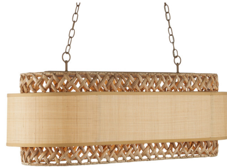
Shown in khaki / natural / tan