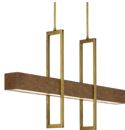
Shown in brass / chestnut

A sophisticated arrangement of rectilinear shapes, the Tonbridge Linear Chandelier also has a rich mix of materials. The vertical rectangles are made of metal in a painted brass finish and the horizontal wood element is in a warm chestnut wood finish. Ian Thornton designed this fixture with long kitchen counters and dining tables in mind. To soften the illumination, the wood rectangle is fitted with an acrylic diffuser. A design detail of note is how the painted brass elements have a bit of antiquing on the corners.