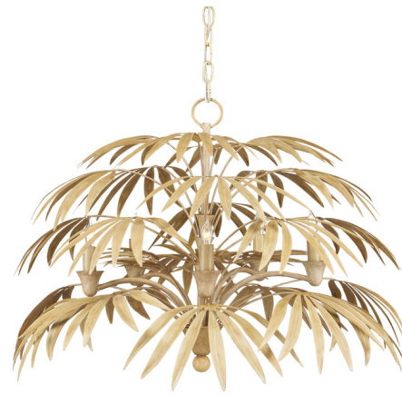
Shown in coco cream

The Calliope Chandelier was inspired by leaves on the bamboo plant. Though the stem and fronds of this tan chandelier read as if they are made of natural material, they are fashioned from wrought iron in a mix of coco cream and ivory finishes that are hand-applied by artisans. The flowing arrangement of the fronds is a design detail of note.