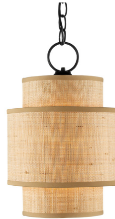
Shown in black / natural

The Mathias Pendant features an elevated design statement to the fabric shades. The metal frame in satin black finish is a contrasting element. Though on the surface this design is seriously simple; it is far from it, as the uniformity of the layered shades seen when looking up into the fixture is a precise effort that takes great skill. Choose from a Natural grass cloth or Mondrian-inspired brightly, multi primary color palate in red, white and yellow.