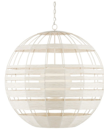
Shown in vanilla / frosted

The Lapsley Pendant, inspired by the planet Jupiter and designed by Clarence Mallari, features irregular bands of twisted Kraft paper twine. The globe cage wrapped by the string is completed in a vanilla finish; the pale intermingling of materials making this a stunning design. A white frosted glass globe evenly distributes the light on this overscaled white pendant.