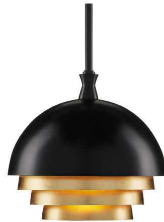
Shown in black / black / gold

The Salviati Pendant features cascading forms that make up the shade that are fashioned from steel in a contrasting mix of deep black and luminous gold leaf. Telescoping rings are inserted into the larger dome in a way that allows the illumination to reflect on each of the gold surfaces for an enhanced glow. The simplicity of the stem and hardware from which it hangs heightens the contemporary feel of this black pendant that was designed by Clarence Mallari.