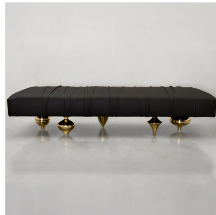
Shown in gold / black leather

The Il Pezzo 1 Bench is an alternation of rounded shapes and geometrical lines, reassuming discipline and freedom, a composite, multiethnic plan in which each component and each material contributes to the harmonious balance of the piece. Il Pezzo 1 Bench is finely upholstered with high-quality leather or velvet with an original technique that makes these pieces sophisticated and rich. The adjustable feet are made of sand brass casting and they are available in different finishes. A small brass cylinder containing the serial number is inserted in every piece to seal the authenticity and uniqueness.