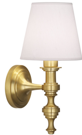
Shown in modern brass / pearl dupioni

The Arthur Wall Sconce is a modern version of the classic candlestick design. The subtly curved body is topped with a cone shaped hardback silk shade. May be direct wired or plugged in with the cord and cord cover. On/Off switch is located on the cord when used as a plug-in.