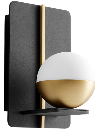
Shown in black / aged brass / matte white

LAMP LIFE . . . . . 30000 hours COLOR RENDERING . . . . . 90 CRI LAMP COLOR . . . . . 3000K LUMENS/WATT . . . . . 84.89 LUMINOUS FLUX . . . . . 382 lumens