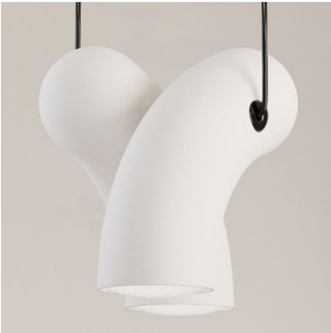
Shown in: Black / Natural Porcelain

The Hyphen Pendant embodies the union of two forms into one with its two-headed design. Hyphen's two cylindrical bodies are joined by a pivot that allows for versatile, directional lighting. Each lamp is hand-crafted by skilled artisans in Morin-Heights, Quebec. Available with a steel body in matte Sandy Black, Chromatic Black which reflects changing colors, or with a matte white Natural Porcelain body.