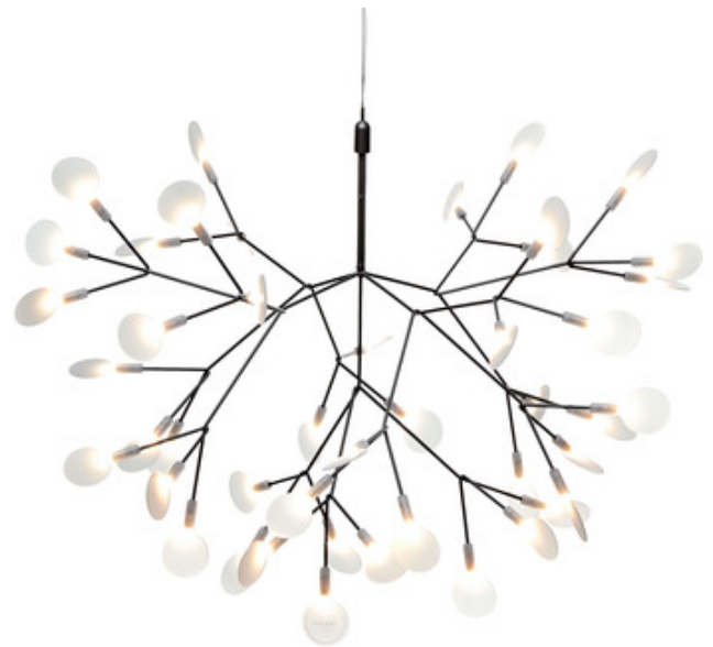
Shown in: Nickel / White

The Heracleum III Pendant was inspired by nature's heracleum plant with white polycarbonate diffusers capping each branch of a splaying metal wire structure. The pendant's shape will add an organic, botanical accent to any space with a distinctly contemporary touch. Available with a 13 foot (157.48 inch) or 32 foot (393.7 inch) cable. Note: The Heracleum is only dimmable using the Wireless Wall Dimmer Switch or with 0-10V dimming systems using the Heracleum III 0-10V Drivers, sold separately.