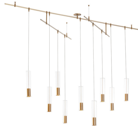
Shown in aged brass / clear