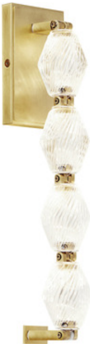
Shown in: Natural Brass / Clear

The Collier Wall Sconce exudes luxury and sophistication. Solid crystal elements made in the Czech Republic are linked together and brilliantly illuminated by integrated LEDs, creating a beautiful column of light. It can hang freely with the included finial attached to the end, or the end can be anchored to the wall using the included standoff. This eye-catching piece makes a stunning statement in any residential or commercial space. A universal 120-277V driver is included, dimmable with a TRIAC, ELV, or 0-10V dimmer. The Natural Brass is a living finish that will patina and warm over time, enhancing its richness. If the patina becomes uneven or spotty, a brass cleaner can restore the finish. Note: This sconce can mount to a standard junction box using the included goof plate, or a 2 x 4 inch junction box with or without the goof plate.