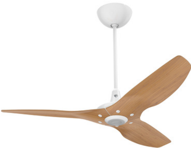
Shown in: White / Caramel Bamboo