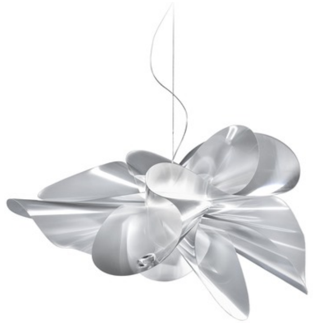
Shown in: White Plastic

It hovers lightly in the air with sublime elegance like a dancing star. Light is the accomplice of with matter: together they start from the center and reach the outermost surfaces propagating in the environment an explosion of energy and theatricality. New Etoile Pendant features discs made of lentiflex with Prisma finish. Available in two sizes. Dimmable via TRIAC dimming.