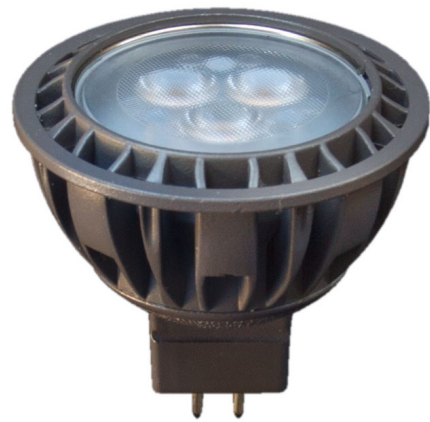
Shown in brown