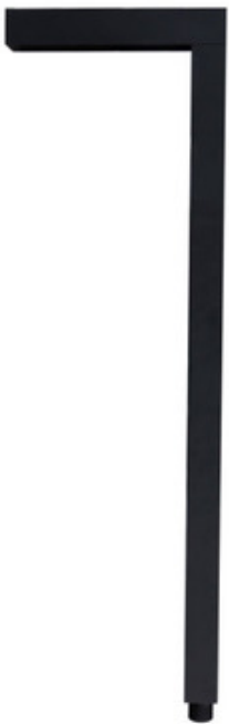
Shown in: Black Aluminum

The Joshua Tree 12V 2-Light Path Light is designed for outdoor path, area, and garden accent lighting. Finish in Black Aluminum with Cerakote series ceramic coating offering superior corrosion resistance, durability, chemical resistance, and thermal stability. Offered in a with or without bulb option. With bulb option includes two 2 watt 12V G4 Bi-Pin Rectangle Wafer LED bulbs. Without bulb option requires two 2 watt 12V G4 Bi-Pin or G4 Bi-Pin Rectangle Wafer bulbs (sold separately). Fixture includes an ABS Mounting Stake, Lighting Shrink Professional Crimp, and Heat Shrink Cable Connector. Note: Required 12 volt transformer and optional accessories sold separately.