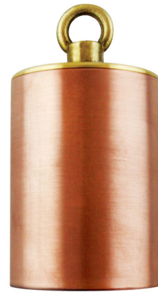
Shown in copper

The Bryce Outdoor 12V MR16 Downlight Pendant is designed for outdoor downlighting techniques in trees or architecture by hanging on a chain or cable. Machined copper and brass finishes offer a living finish that weathers over time to a unique patina. Black brass finish with Cerakote series ceramic coating offers superior corrosion resistance, durability, chemical resistance, and thermal stability. Offered in a with or without bulb option. Hang the fixture from a secure stainless steel eye bolt, with or without a chain. Fixture includes a 24 inch watertight cable connector lead (electrical cable supplied by others). Note: Not intended for hardwire installation (no canopy included). Required 12 volt low voltage magnetic transformer, and optional chain or cable (by others) sold separately.