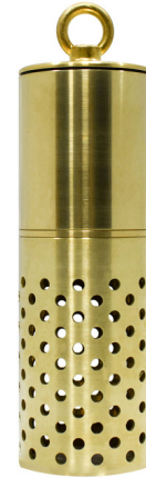
Shown in brass

The Glacier Perforated Outdoor 12V MR16 Downlight Pendant is designed for outdoor downlighting techniques in trees or architecture by hanging on a chain or cable. Machined copper and brass finishes offer a living finish that weathers over time to a unique patina. Black brass finish with Cerakote series ceramic coating offers superior corrosion resistance, durability, chemical resistance, and thermal stability. Fixture includes a Lighting Shrink Professional Crimp and Heat Shrink Cable Connector. Note: Required 12 volt low voltage magnetic transformer and optional chain or cable sold separately.