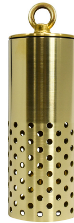
Shown in brass

The Bryce Outdoor 12V MR16 Perforated Downlight Pendant is designed for outdoor downlighting techniques in trees or architecture by hanging on a chain or cable. Machined copper and brass finishes offer a living finish that weathers over time to a unique patina. Black brass finish with Cerakote series ceramic coating offers superior corrosion resistance, durability, chemical resistance, and thermal stability. Offered in a with or without bulb option. Hang the fixture from a secure stainless steel eye bolt, with or without a chain. Fixture includes a 24 inch watertight cable connector lead (electrical cable supplied by others). Note: Not intended for hardwire installation (no canopy included). Required 12 volt low voltage magnetic transformer, and optional chain or cable (by others) sold separately.