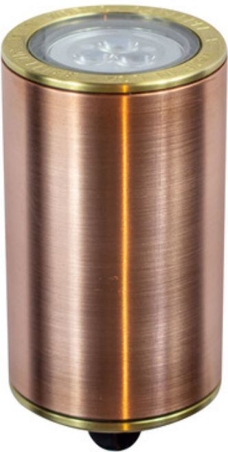
Shown in: Copper / Clear

The Carlsbad 12V Well Light is designed for outdoor in ground uplighting. Machined brass or copper finish offers a living finish that weathers over time to a unique patina. Black brass finish with Cerakote series ceramic coating offers superior corrosion resistance, durability, chemical resistance, and thermal stability. Glass lens. Offered in a with or without bulb option. Fixture includes Lighting Shrink Professional Crimp and Heat Shrink Cable Connector. Note: Required 12 volt transformer sold separately.