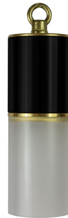
Shown in black brass / frosted

The Glacier Outdoor 12V MR16 Downlight Pendant is designed for outdoor downlighting techniques in trees or architecture by hanging on a chain or cable. Machined copper and brass finishes offer a living finish that weathers over time to a unique patina. Black brass finish with Cerakote series ceramic coating offers superior corrosion resistance, durability, chemical resistance, and thermal stability. Shade in frosted acrylic. Fixture includes a Lighting Shrink Professional Crimp and Heat Shrink Cable Connector. Note: Required 12 volt low voltage magnetic transformer and optional chain or cable sold separately.