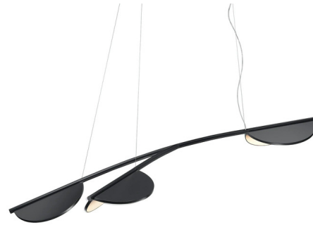
Shown in white / anthracite

COLOR RENDERING . . . . . 95 CRI LAMP COLOR . . . . . 2700K LUMENS/WATT . . . . . 280.00 LUMINOUS FLUX . . . . . 4200 lumens