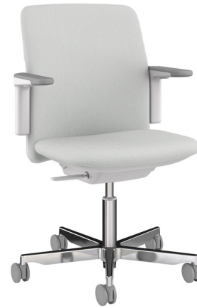
Shown in polished aluminum / vapor revival knit

The Path Task Chair contains a mechanism that uses gravity and the sitter's own bodyweight, that when you recline, it gently lifts, so your body becomes the counterbalance to the chair, and is firmly supported wherever it stops. This creates a custom fit chair that provides streamlined support and adjusts automatically and moves completely in sync with you. To complete the ergonomic design, the Path chair was developed with recyclable FormSense Eco Knit, a mesh-like textile where each stitch is individually controlled and creates patterns with targeted zones of tension to create a beautifully responsive experience. Adjustable armrests and chair height.