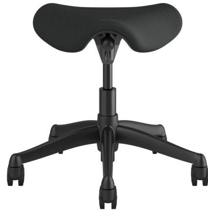
Shown in graphite / graphite corde stretch fabric

The Freedom Stool features a triangular cushion that ensures hips are supported and tailbone pressure is reduced. The design of the cushion allows for multiple sitting positions, and lowers the thighs and increases circulation throughout the lower body. The result is a fun, versatile, and ergonomic stool that encourages movement while remaining comfortable and promoting long-term wellbeing in the workspace. Choose between Saddle seat option or a smaller, more compact seat option, Pony. Note: Pony stool not available in Lotus Shale fabric. Saddle stool not available in Black Corde stretch fabric.