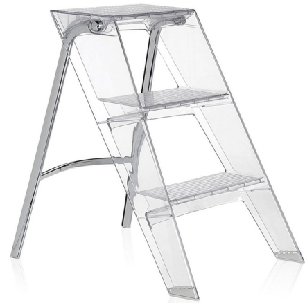
Shown in chrome / transparent crystal clear

The Upper Folding Stepladder brings a modern touch to your home tools collection. Designed by Alberto Meda and Paolo Rizzatto, the step ladder is crafted of a combination of chrome-plated steel and a proprietary renewable and sustainable, transparent material. Ready for use as soon as it arrives, this colorful design can support a maximum weight of 570 pounds, while the slip-resistant steps ensure your safety.