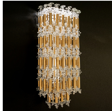
Shown in heirloom gold / optic crystal

The Tahitian Wall Sconce is inspired by the Zen of a bamboo forest. The smooth frame is complemented by upscale crystals, casting warm shadows across your room. Color temperature adjustability switch from 3000K/3500K/4000K at time of installation mounted at the back of the mounting plate to be installed within the junction box.