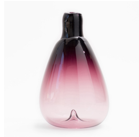
Shown in heliotrope

The Bottle Vessel is a stunning display of handblown Glass. The necks are double-dipped, and the mouths are broken hot from the glass blower's pipe. It features a slight indent on the bottom. No two are exactly alike and the dimensions are approximate. Made in the Czech Republic.