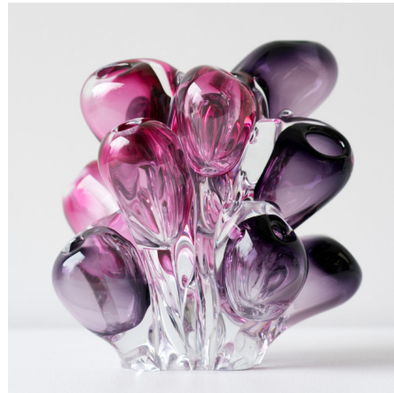
Shown in pink palette

The Bloom Object is a handblown Glass sculpture resembling a blooming flower. It features an arrangement of smaller pod shapes fused together while hot. No two are exactly alike - all dimensions are approximate. Made in the Czech Republic.