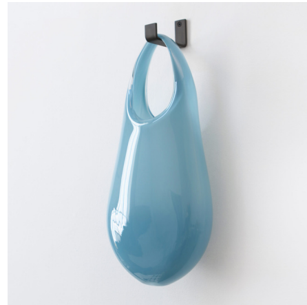
Shown in dark oxidized / opaque new blue

The Hold Vessel features a contemporary design and superb versatility. This handblown Glass wall vase appears to stretch from its hook and can be a functional vase or a sculptural object. Due to their handmade nature, no two are exactly alike. Made in the Czech Republic.