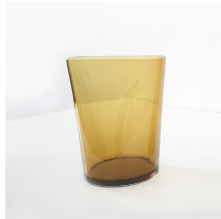
Shown in olivin

The Pinch Vessel from SkLO is a sophisticated display of transparent Glass. This vase features a cylindrical base with an elongated oval shape on top. Due to its handmade nature, all glass dimensions are approximate. Made in the Czech Republic.