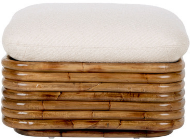
Shown in: Antique Gloss Rattan / Lupo Diagonal Boucle 7

The Bohemian 72 Ottoman was conceived by designer Gabriella Crespi as a means to unite indoor and outdoor living with a versatile piece at home in either environment. The ottoman's rattan frame features a stacked base and upholstered seat cushion for a casual but refined style that embodies the mid-century jet-set aesthetic. While the ottoman was originally produced only for private clients, Gubi celebrates the 50th anniversary of this iconic design by bringing it into general production.